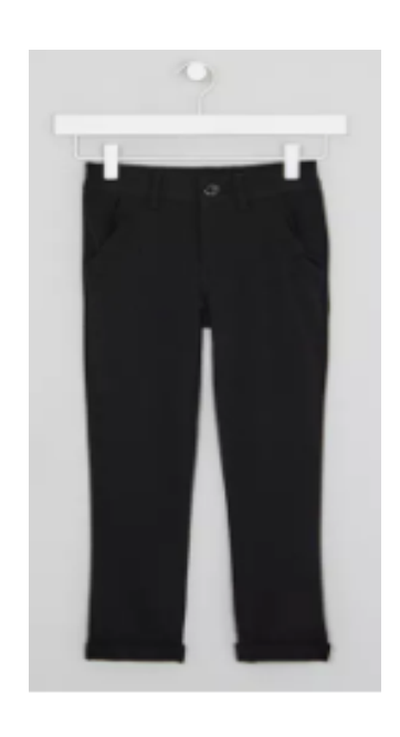
Girls Slim Leg School Trousers (3-13yrs)