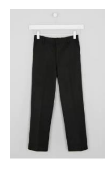
Boys Classic School Trousers (3-16yrs)