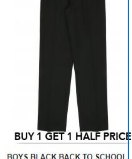
BOY'S BLACK BACK TO SCHOOL TROUSERS