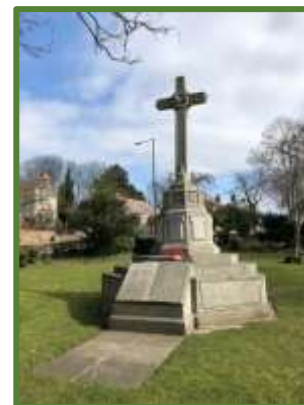
Acomb War Memorial