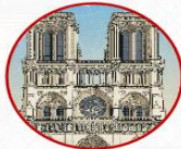
Notre Dame Cathedral